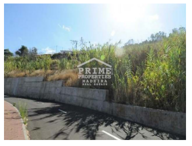
600 Land Area (m²)