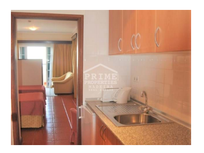
= 8 Bedrooms